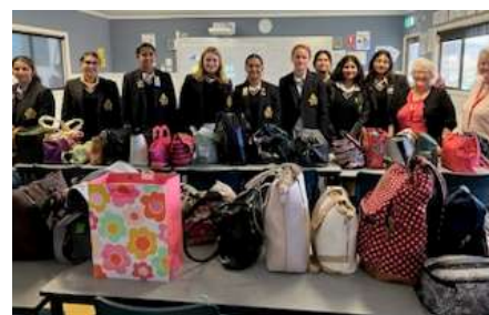
BMZ & Zonta members with the Dignity packs

This was the last activity for the Z Club in 2023, and they should all be very proud of their achievements since the Club was formed in July 2023.