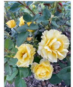
Zonta Roses in my garden

For me the year started off with cleaning, getting rid of clutter and I've actually found space in my sewing room. Then it was gardening, picking vegetables, more cleaning, more gardening and more cleaning. It is amazing what I found, and the time spent reminiscing over old family photos. I am not quite finished but feel excited about what I have achieved so far. So much so, that I have set myself a theme this year. It is a song that has been following me around on the radio and on television..... So, I'm sticking with it! It goes something like this – "I'm so excited and I just can't hide it, I'm about to lose control and I think I like it..." that was enough to set me up for the year.